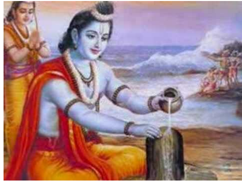
Lord Rama worships Siva