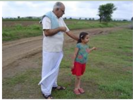
TEACHINGS OF POOJYA SREE BHAGAWAN